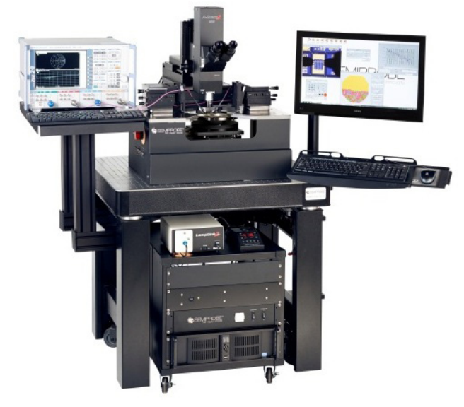
SA-6 semiautomatic probe system with compound optics, HF manipulators mounted on a vibration isolation table - several configurations available.

All SemiProbe semiautomatic and fully automatic systems operate on the powerful PILOT control software suite, designed employing the same adaptive architecture philosophy as the PS4L hardware. PILOT is modular, intuitive and easy to learn. Additional control modules for added features and accessories can be implemented without changes to the core control software. Common functions such as 2 point alignment are wizard-based for easy operation - even for the occasional user. For setup or occasional users, the software can be bypassed and total control moved to a local joystick.